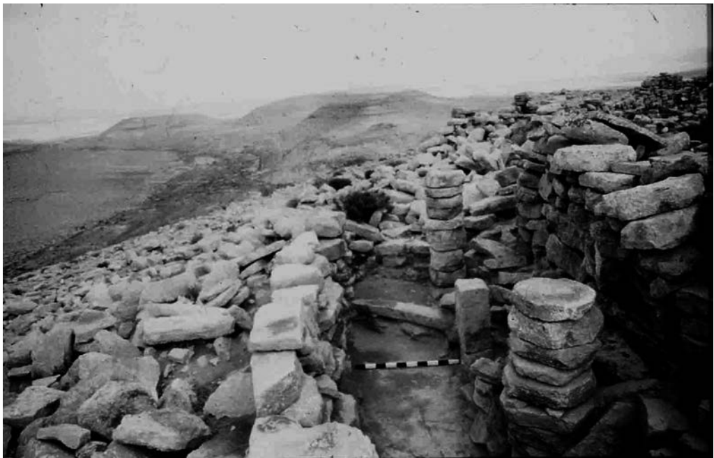
Figure 4. Casemate wall of Iron Age hill fort of Nahal Akrav, Central Negev.

In the Negev, the Nabatean Spice Route, leading from the Red Sea to Petra and across the Negev to the Mediterranean Sea (e.g., Cohen 1982; Evenari et al. 1982:32; Meshel and Tsafirir 1975), is the first caravan route to show clearly the infrastructures we associate with caravan trade, way-stations (caravanserais), watch-towers, road markers, and cisterns not directly associated with habitations. The spacing of the Nabatean caravanserais through the Negev, roughly 15-20 km between stations, suggests a day's journey. The caravanserais themselves are equipped with