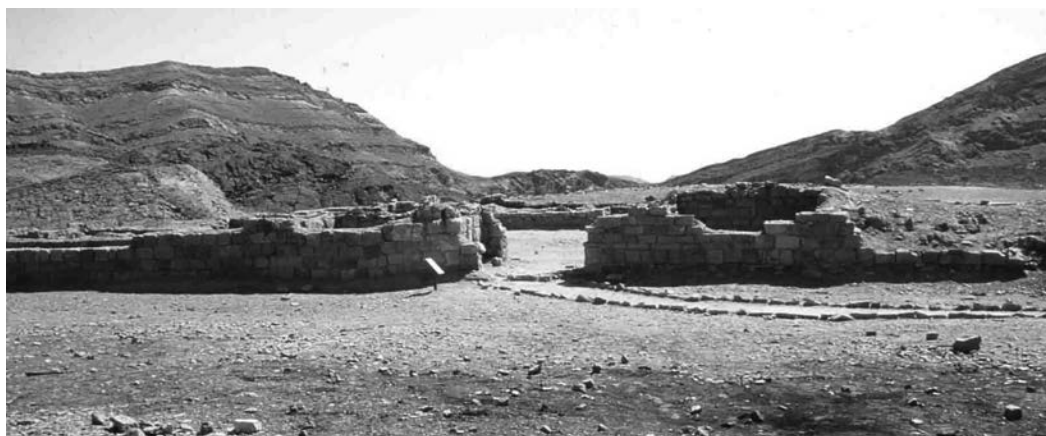
Figure 1. The Ein Saharonim (Sha'ar Ramon) Nabatean caravansary, located in the Central Negev.

term perspective, the caravan trade is the culmination of earlier trade systems traversing the desert. These trade systems seem to originate as early as the Neolithic (and perhaps the preceding Late Epipaleolithic), with small-scale goods such as shells and green stones moving between the desert and the settled zone (e.g., Bar-Yosef Mayer 2005; Wright and Garrard 2003). They evolved concomitant with changing technologies, increasing