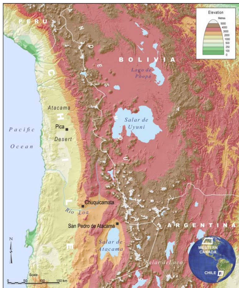
Figure 5. Map of northern Chile, showing locations mentioned in the text.

innumerable caravan trails used first by llamas, and later by horses and donkeys in historic times. In addition to the presence of extensive caravan trails throughout northern Chile, images of caravans were recorded in rock art and geoglyphs: depictions of camelids are prominent. A typical caravan scene portrays a human holding a line tethered to one or more camelids, and camelids with loads on their backs. A geoglyph scene in the Quebrada de los Pintados, which is crossed by a major north-south caravan trail, contains over a hundred identically depicted camelids in a single line (Figure 6). The landscape of caravan trails is dotted with stone piles of various configurations and sizes, created as coverings for burials, pause points to reflect on the journey passed and to be undertaken, and route markers. The 'eared' markers ( hitos ) built on the summits of a northern Chilean Inca road, stood out uniquely among the rock piles for ritual and memory, and likely had a similar function to the lopsticks of Canadian winter roads (Lynch, personal communication, 2018).