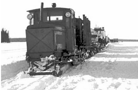
Figure 2. Linn tractor pulling “cat swings” of freight through snow. 1933, Linn Tractor.

The Linn tractor (built 1916-1952) proved to be an excellent solution for hauling the cargo loaded on sleighs across ice and frozen muskeg. Ski runners attached in the front allowed the rear axle-powered roller chain on a flexible track to move through snow efficiently. When additional tractors were added, the amount of load that could be carried was impressive: a Linn tractor train hauled a 120 ton load between Flin Flon and the depot 3 (Theobald 2014). Each “cat-swing” was comprised of tractors and freight sleighs, followed up by a caboose where the crew ate and slept in 8-hour shifts. A cat-train consisted of several cat-swings that travelled together (Figure 2).