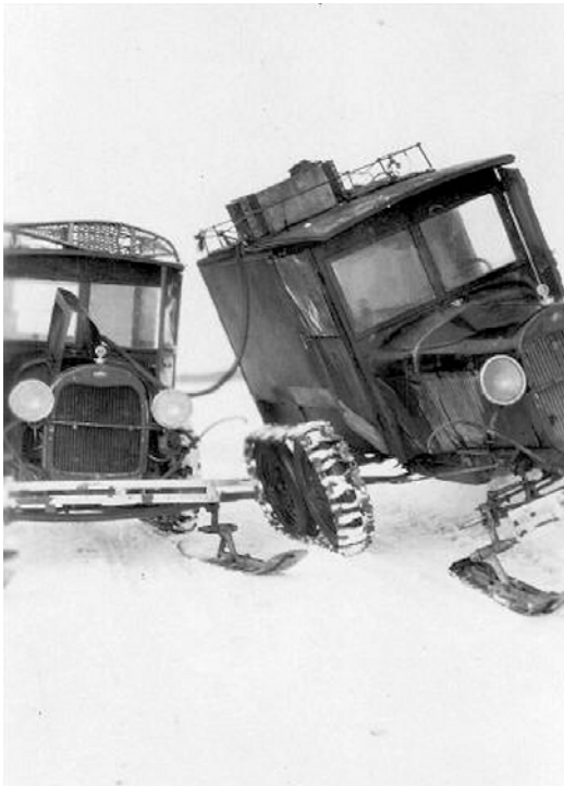
Figure 3. Modified Ford Model As with skis on front and rear wheels with chains. Northern Canada, from Huffaker Journal, photo dated 1931.

Ford Modelo A modificado con esquíes en las ruedas delanteras y traseras con cadenas. Norte de Canadá, tomado del Huffaker Journal, fotografía con fecha de 1931.