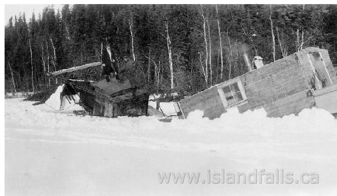
Figure 4. Linn tractor broken through the ice, northern Canada.

Ice break-throughs did not always conveniently occur in shallow water. Jack Johnson's (son of company founder Hi Johnson) job was to dive into dark slushy bogs to hook up sunken loads at depths of up to 80' (24 m)—an incomprehensibly frigid and blind task. Some loads were just too heavy and deep to retrieve—like the load of gold lost en route from the God's Lake (Manitoba) mine (Pat Johnson, personal communication 8III17).