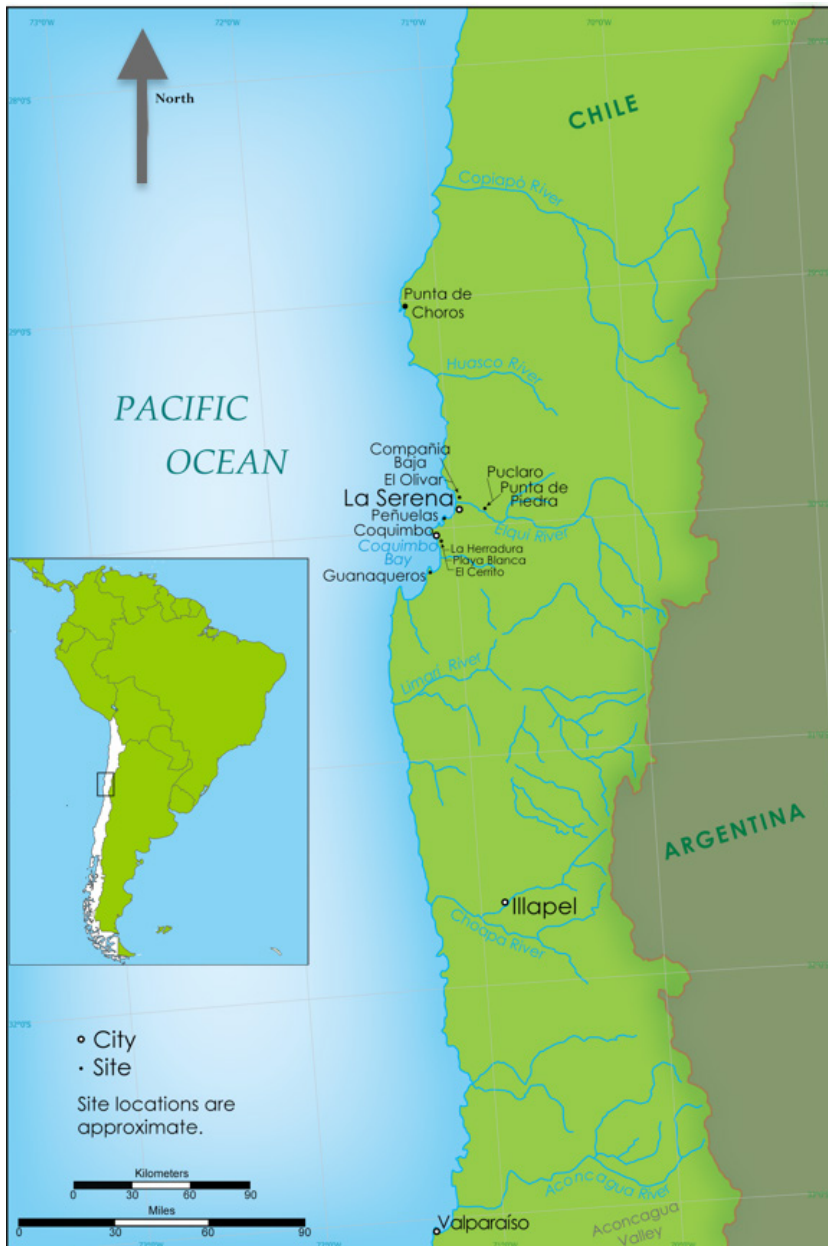
Figure 1. Semi-arid north of Chile with analyzed archaeological sites and major waterways indicated. Excavations were conducted in the early-mid 20th century prior to the use of GPS data, hence the approximate site locations.

Norte semiárido de Chile con sitios arqueológicos analizados y principales cursos de agua indicados. Las excavaciones se llevaron a cabo en la primera mitad del siglo XX antes del uso de datos de GPS, de ahí que las ubicaciones de los sitios sea aproximada.