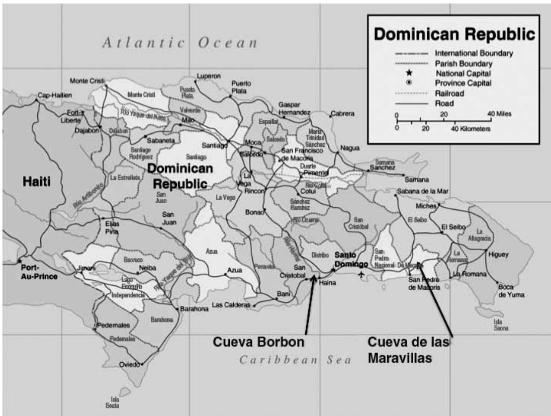
Figure 1. Map of the Dominican Republic with the cave sites mentioned in text.

Mapa de la República Dominicana con las cuevas mencionadas en el texto.